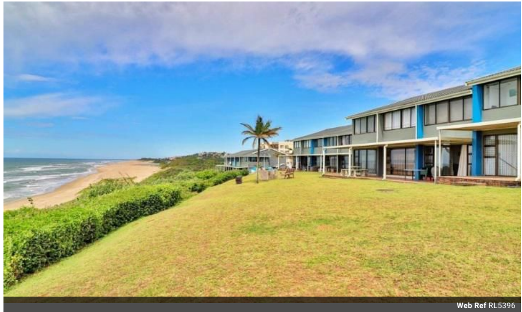
Web Ref RL5396

Shop 26 Pretty Gardens Langenhoven Park Bloemfontein